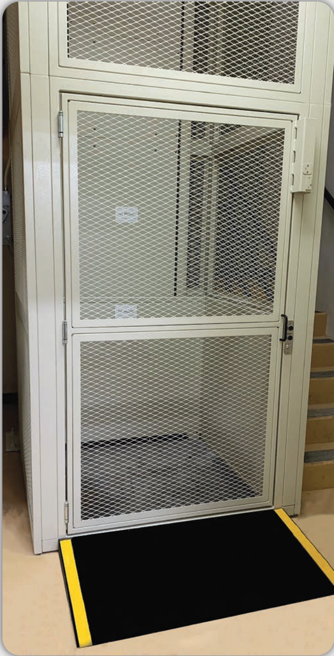
Shown with optional stationary ramp and expanded metal gate