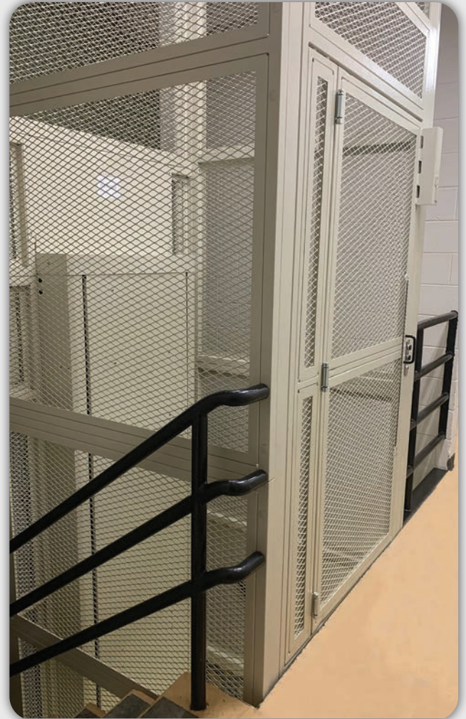
Shown at top landing with optional expanded metal gate