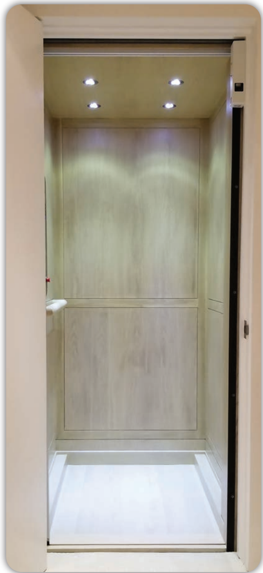
The car flooring and finishing shown is by others and required a 2½" threshold ramp

For Residential Applications where a pit is not feasible